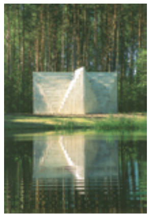
Sol LeWitt. Double Negative Pyramid COLLECTION