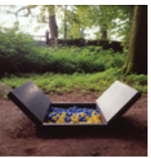
Miroslaw Balka. Play-pit