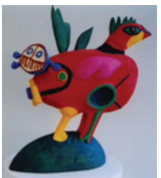
Corneille. Colour Bird