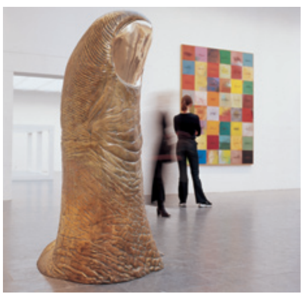
Interior with César's The Big Thumb.