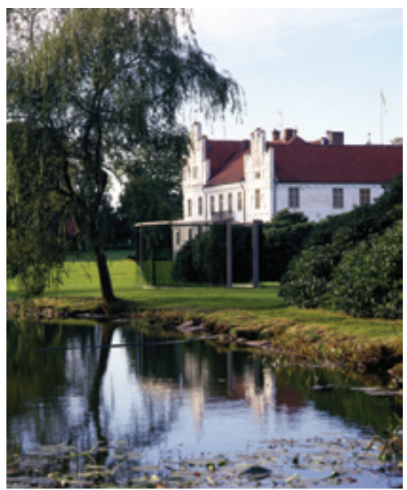
View of the Wanas Castle with Dan Graham's Two Different Anamorphic Surfaces