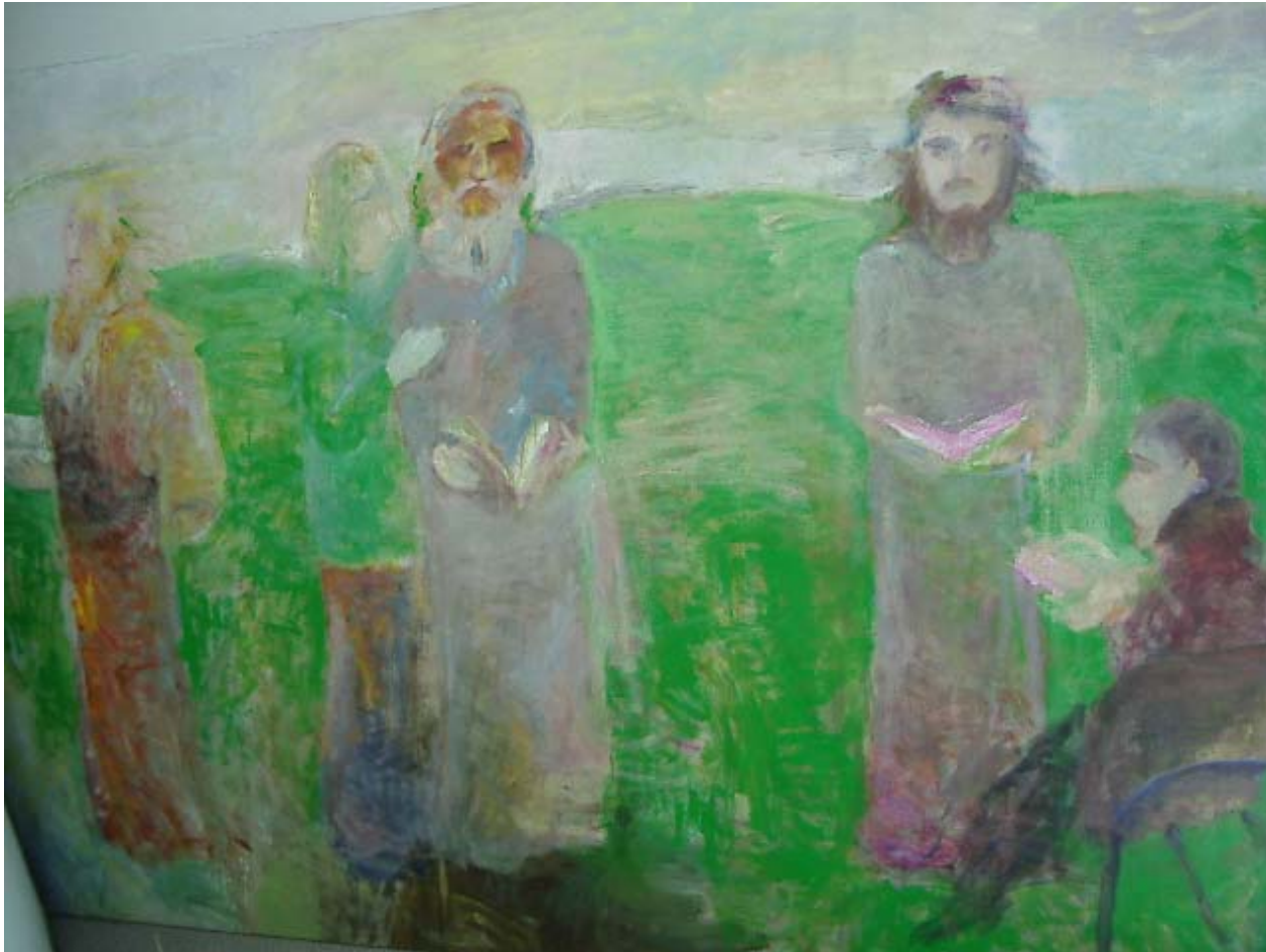
⌘ Peeter Mudist (Estonia) LESSONS OF BELIEF, oil on canvas, 2002